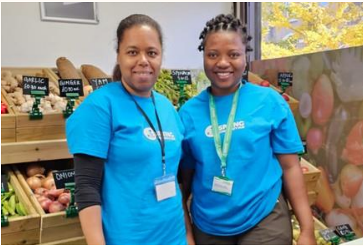
Photo of two Spring Community Hub members standing and smiling in front of the food store.

Spring Community Hub suggests that if you're setting up a project like this, to speak to the local community centres and food projects to see how you can work together, co-create , to ensure that the food you have doesn't go to waste and people eat nutritiously.