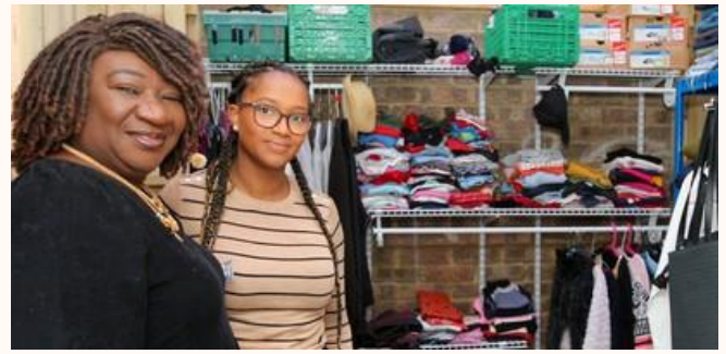
Photo of two Spring Community Hub members standing and smiling in front of the clothes bank.

We invite you to actively maintain the relationships you’ve started to build with local community centres & projects.