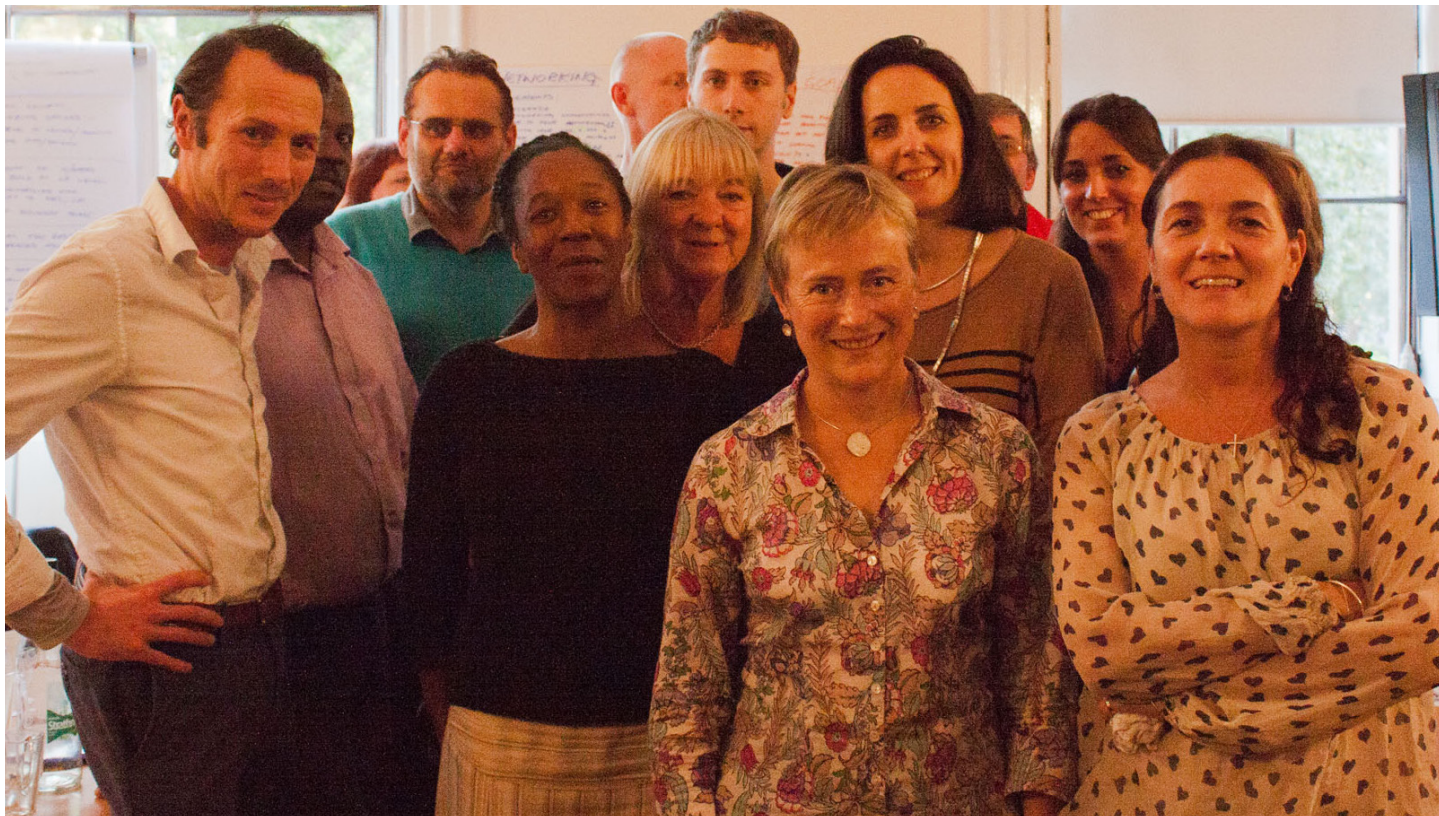
Above: The NSUN Team and Trustee Development Day 2014. Visioning for the future.